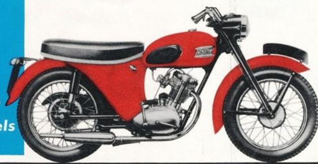
▲ T 20 In Aztec Red and Black

Lightweights In utility, Junior and sports models