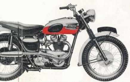
▲ TR6/B TROPHYBIRD, SCRAMBLER For Club Competition or off-the-road events. Has dual upswept pipes, wide ratio gears, Trials-Universal tire on front, Sports "Knobby" tire on rear. In two-tone Ivory and Aztec Red

Scooters Top performance in the Motor Scooter Field