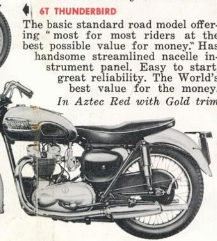
▲ 6T THUNDERBIRD The basic standard road model offering "most for most riders at the best possible value for money." Has handsome streamlined nacelle-instrument panel. Easy to start, great reliability. The World's best value for the money. In Aztec Red with Gold trim

NEW 5T/A SPEED TWIN STREAMLINER 30.5 cu. in. (500 c.c.)